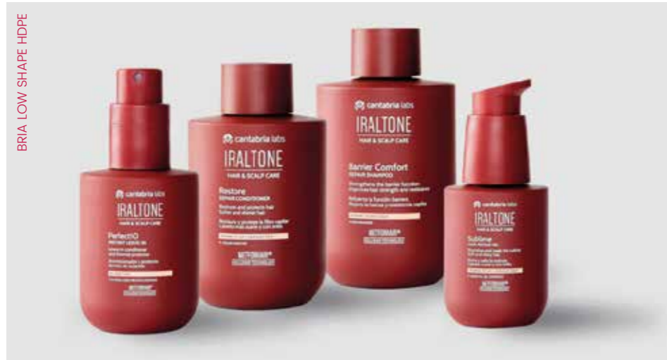
BRIA LOW SHAPE HDPE