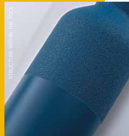
STRUCTURE WITHIN THE TOOL