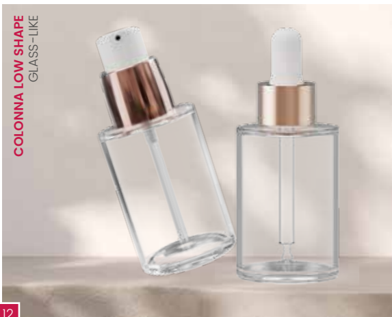
COLONNA LOW SHAPE GLASS-LIKE