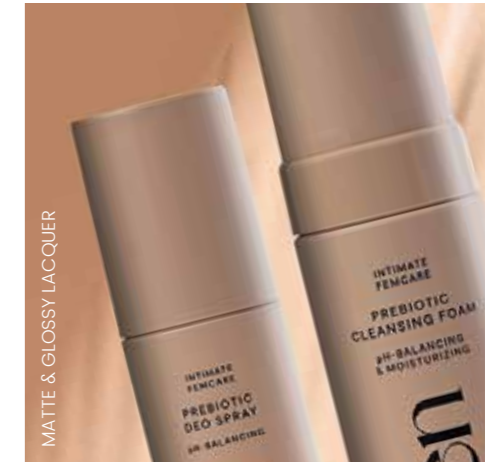
MATTE & GLOSSY LACQUER