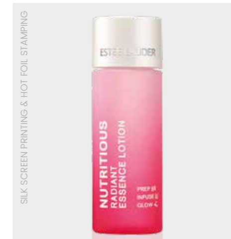
SILK SCREEN PRINTING & HOT FOIL STAMPING