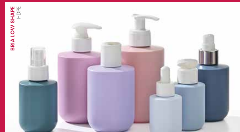
BRIA LOW SHAPE HDPE