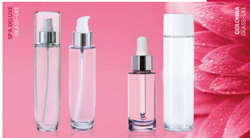
SPA DELUXE GLASS-LIKE