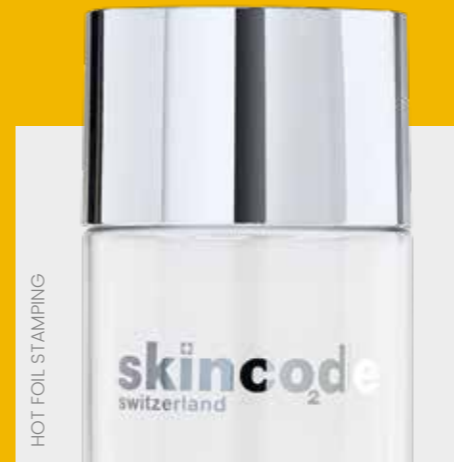
HOT FOIL STAMPING