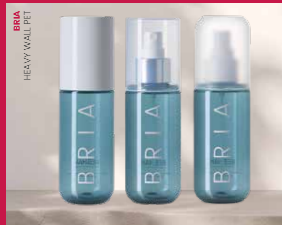
BRIA HEAVY WALL PET