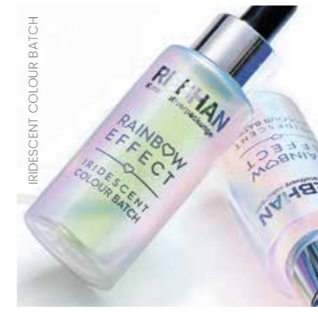
IRIDESCENT COLOUR BATCH