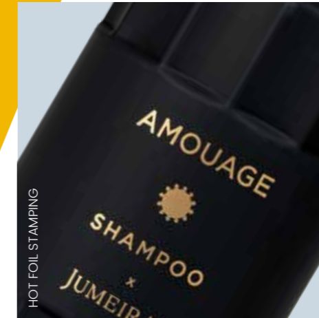
HOT FOIL STAMPING