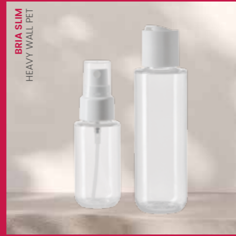
BRIA SLIM HEAVY WALL PET

Here we have compiled a small selection of our