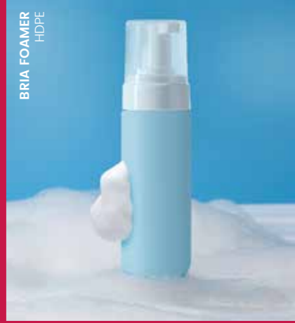
BRIA FOAMER HDPE